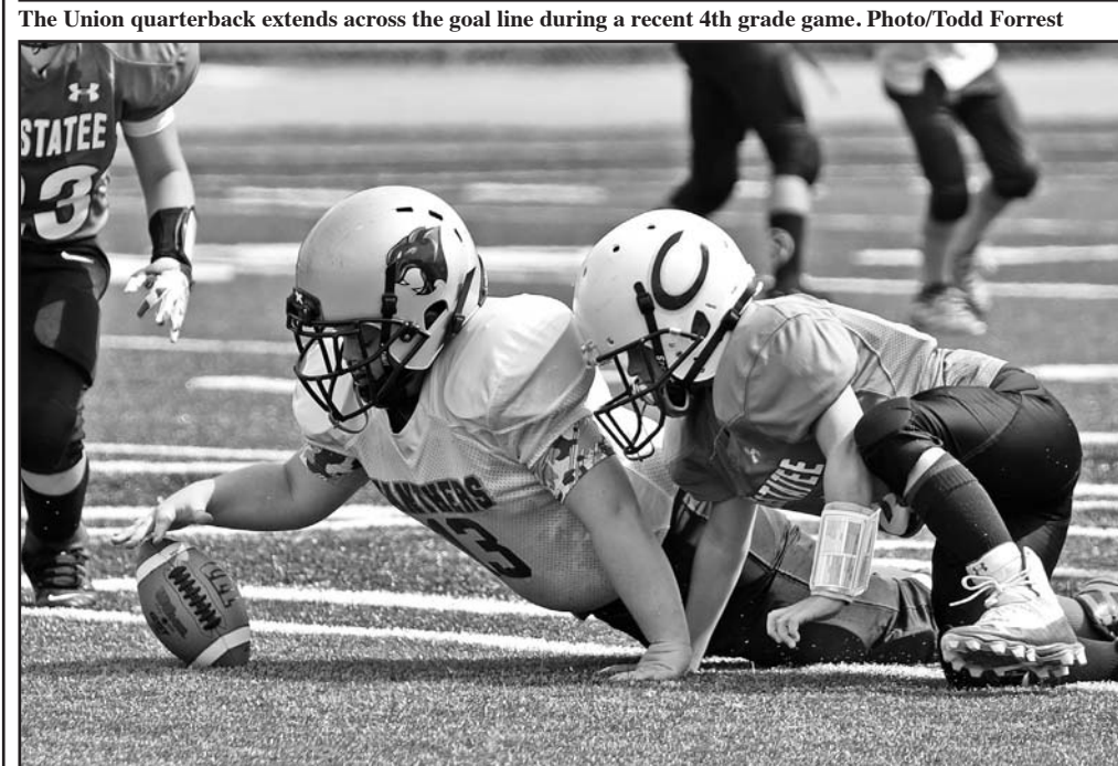
A Panthers defensive lineman recovers a fumble during an Oct. 2 game vs. Chestatee